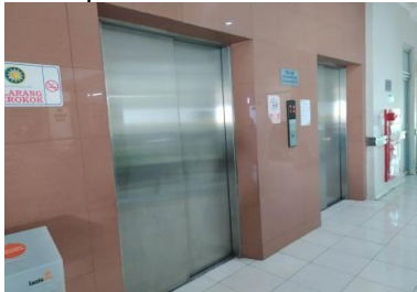
Figure 9. Hospital Lift Picture

In addition to stairs for specific situations as a vertical connection, patients, their families, and staff can use the elevator in the emergency room area to access the first floor and the floors above. The elevator requirements based on standards are a minimum effective size of 120 cm x 240 cm with a minimum door opening width of 120 cm. The elevator doors are equipped with automatic sensors. Two elevator units are located in the center of the east side of the building, adjacent to the stairs. The passenger elevator is used for vertical circulation between floors, from the first floor to the fourth floor. The elevator size meets the requirements. The elevator wall finish uses maroon-colored granite material.