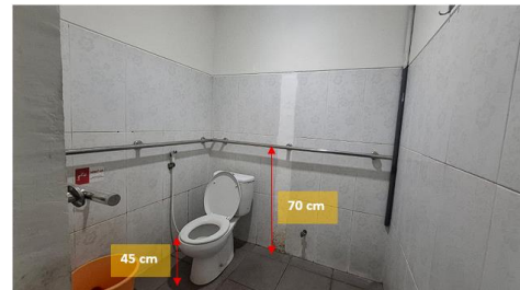
Figure 5. Interior Toilet Picture