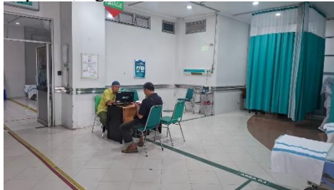
Figure 2. Waiting Room Picture

of the universal design principle of Perceptible Information. Officers can understand these signs. The patient waiting area is quite spacious and allows wheelchair users to wait in this area. Wall handles are available on the walls to assist patients and family members who have difficulty walking, in line with the principle of Equitable Use. The receptionist is quite informative, but the registration method is still manual. The lighting in the room is relatively adequate, both natural and artificial. In areas where procedures and observations are required, lights have been installed at those specific points.