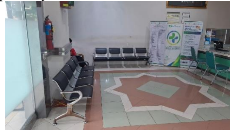
Figure 3. Waiting Room Picture