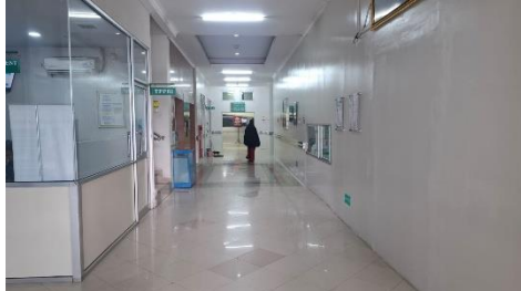
Figure 10. Hospital Corridors Picture

department area is 340 cm wide, allowing patient beds to pass through. This is in accordance with PMK No. 40 of 2022, which stipulates that the width of corridors and hallways for two patient beds passing each other must be at least 240 cm. The following are the results of observations in the room.