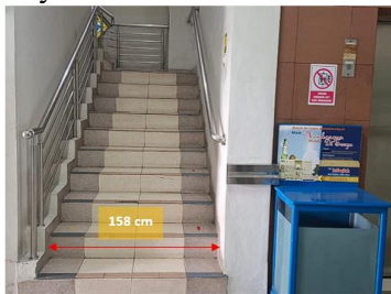
Figure 8. Stairs Picture

As a vertical connector, the stairs in the emergency room area are used as an evacuation route and also as a means of access for patients' families and staff. The standard requirements for stairs are a minimum width of 120 cm, a maximum distance between stairs of 40 m, an optrade of 15-18 cm, an antrade of at least 30 cm, equipped with handrails, and adequate lighting. Based on observations in the field, the staircase width is 158 cm with a rise of 30 cm and a run of 17 cm. This analysis is in accordance with the principles of Low Physical Effort Universal Design.