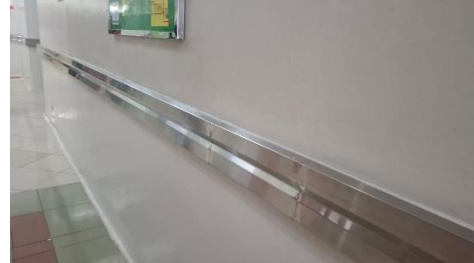
Figure 11. Hospital Wall Guard Picture

2) Based on analysis of observation results and standard data