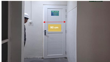
Figure 4. Toilet's Door Picture

The toilet in the emergency room has fairly good facilities, including a 90 cm wide door with an outward opening. Inside the toilet, there is a handle bar for people with disabilities to stand up in accordance with the application of the Size and Space for Approach and Use principle, in accordance with PUPR Regulation No. 14 of 2017, which stipulates that the height of the handle bar for disabled toilets is 70 cm and the height of the monoblock toilet is 46 cm. The difference in elevation between the bathroom and the corridor floor is addressed with a ramp. The mirror is installed 1.90 meters from the floor, and the sink is 74 cm from the floor.