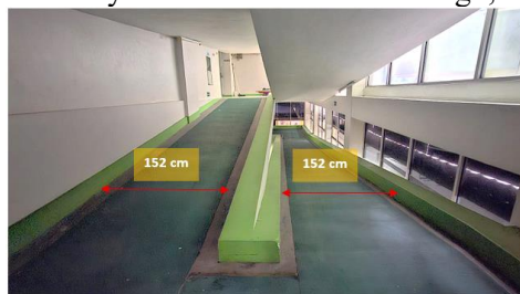
Figure 6. Ramp Picture

To connect the first floor and the floors above it, as well as to provide patient evacuation access, the emergency room area uses a ramp as vertical access. The ramp is designed using reinforced concrete and anti-slip textured carpet to prevent slipping. The ramp has a slope of less than 7° so that users can comfortably cross it. In accordance with the principles of Low Physical Effort universal design, users do not feel fatigued when using this facility.