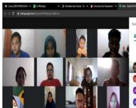
Figure 2. Distance learning

Figure 1 showed that all students were together in class room, they can create social interaction between each other. Teacher can stand in front of classroom and made discussion during the class. Meanwhile Figure 2 described students and teachers really depend on internet connection, they had lack of social interaction because they were in different area. Both classroom and distance learning had strong and weaknesses in teaching learning process.