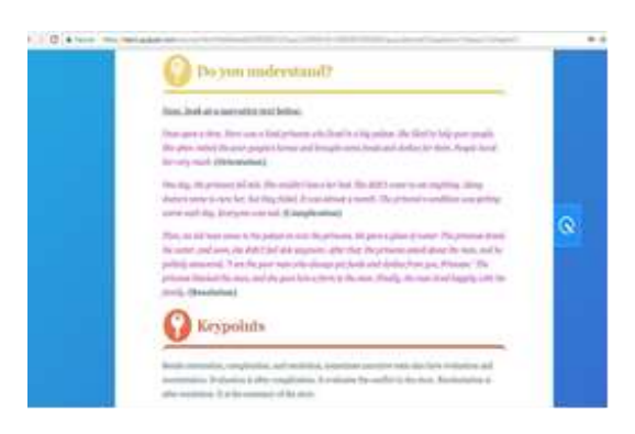
Figure 1-3 are a sample of teaching material that has been provided by the database. It is intended for students of the ninth graders of junior high school. It is about understanding narrative text: Legends and Fables.