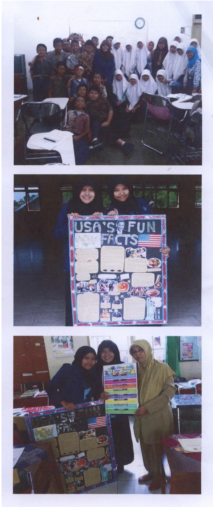
Picture 1. USA's Fun Facts and Poster