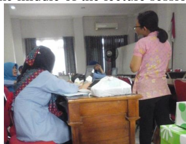
Figure 4. Discussions Between Me (Right) and The Several Participants (Left)