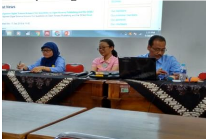
Figure 2. Opening session (left to right: an MGMP representative, me, and the principal of the host school)

Yogyakarta to SMA Negeri 1 Sewon, Bantul, Yogyakarta. Hence, the training was opened by the Principal of SMA Negeri 1 Sewon, which became the host school. Figure 2 shows the opening session of the training.