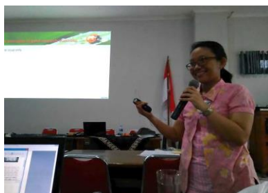
Figure 3. Lecture on Research Questions

The next material was on the principles of research questions. The participants were told that a good research question should be about one issue only as well as specific and focused (White, 2009). For example, a research question “To what extent does the use of picture cards affect learners’ vocabulary mastery?” only focuses on one issue, vocabulary mastery, and this issue is specific enough. If “vocabulary mastery” was changed into “English learning”, the research question would cover too broad a scope. The second principle was that a research question should be free from assumption (Creswell, 2014). I shared to the participants that before ones try to ask question about certain problems, they should make sure that those problems exist in the first place. Thus, the first question is usually in the form of Yes/No question, for example, “Does the use of picture cards affect learners’ vocabulary mastery?” However, typical Yes/No questions would just require a straight Yes/No response, which may not be desirable in research which necessitates in-depth elaborations. Thus, researchers should “modify” this original Yes/No question to “To what extent + Yes/No question” to enable researchers to expand their results in an elaborative manner instead of answering with a straight “Yes” or “No”, hence the modified research question “To what extent does the use of picture cards affect learners’ vocabulary mastery?”