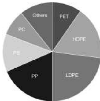
Figure 1. Plastic wastes composition [1]